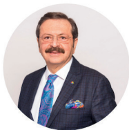
Rifat Hisarciklioğlu Union of Chambers and Commodity Exchanges of Türkiye