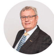
Vladimír Dlouhý President of Czech Chamber of Commerce (from 23 March 2023)