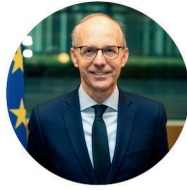
Luc Frieden President of Chamber of Commerce of Luxembourg (until 23 March 2023)