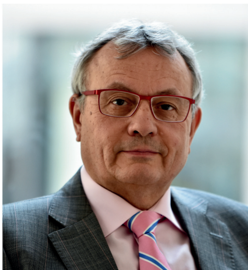
Vladimír Dlouhý, President of Eurochambres

The EU epitomises the notion of being stronger together and that is very much reflected in the way that Eurochambres works. With this in mind, I express my warm gratitude to: our members for their ongoing confidence and engagement; the many EU politicians and officials with whom we work at different levels and at different stages in definition and rollout of EU policy; the numerous other organisations and stakeholders with whom we worked during 2023; and, of course to the Eurochambres staff for their commitment and skill in overseeing the day-to-day activities of our association, as set out in this report.